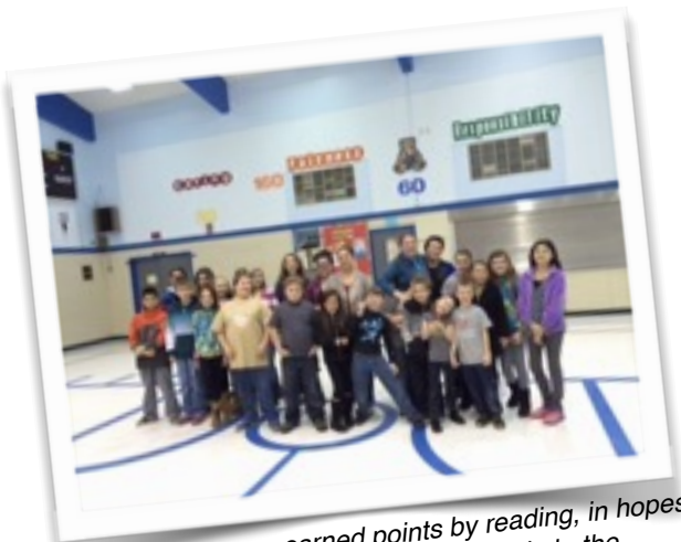
Students who have earned points by reading, in hopes of meeting their grade goal and earn a trip to the Waterslides in Redding.